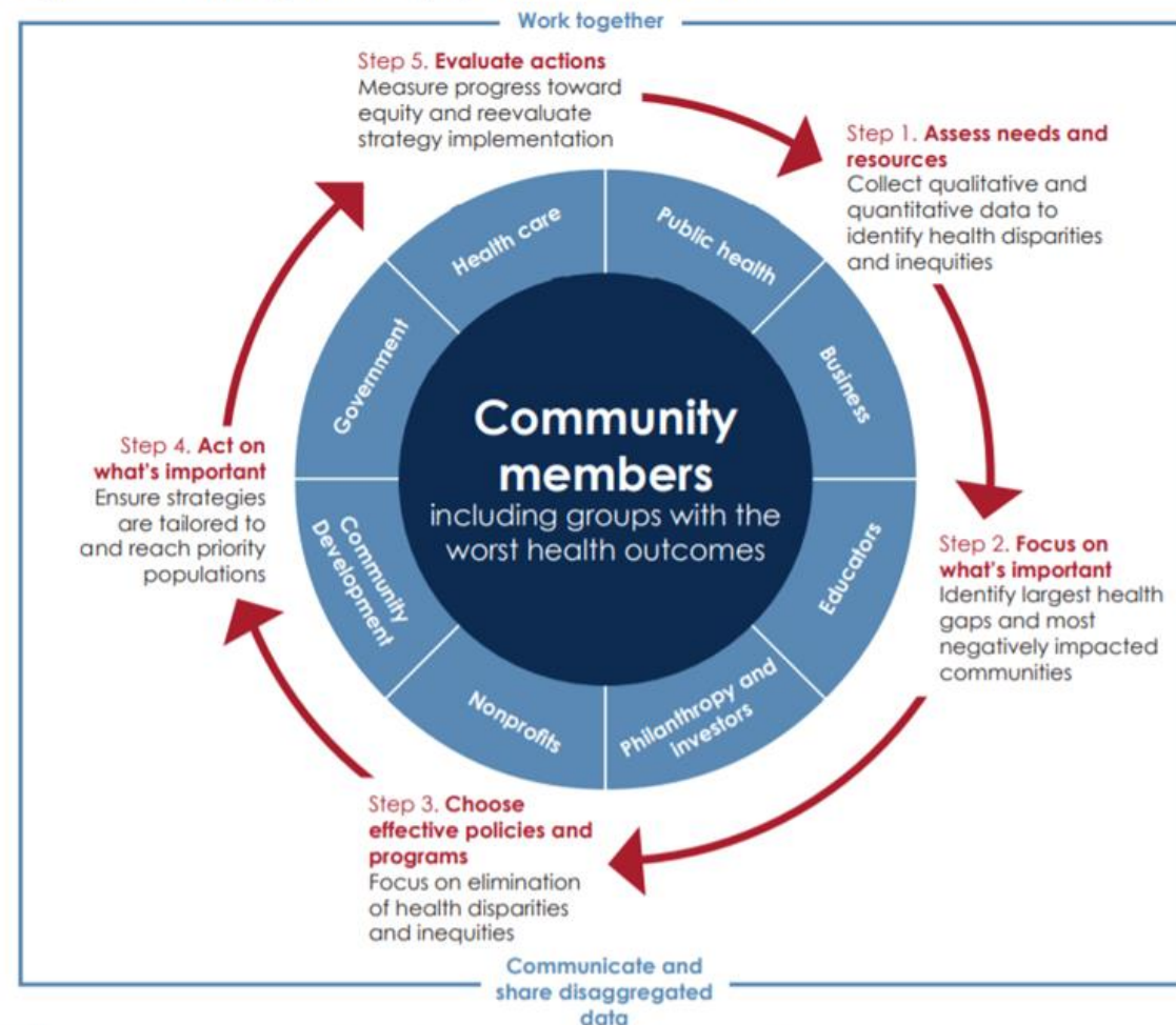
Figure 7. Achieving health equity: Framework for action